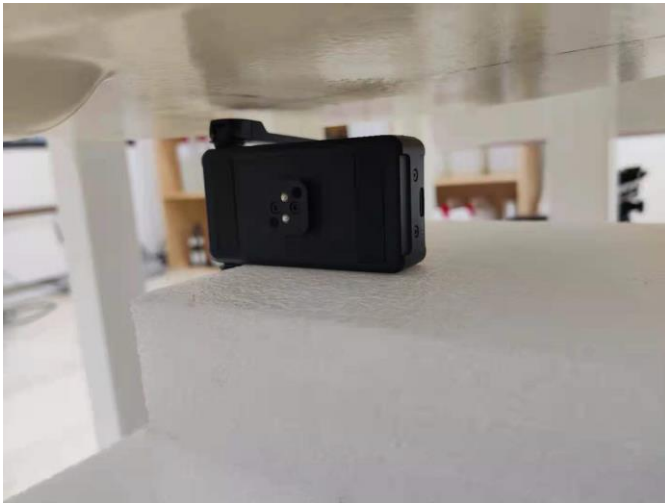
Left Side (5mm)