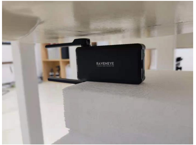
Bottom Side (5mm)