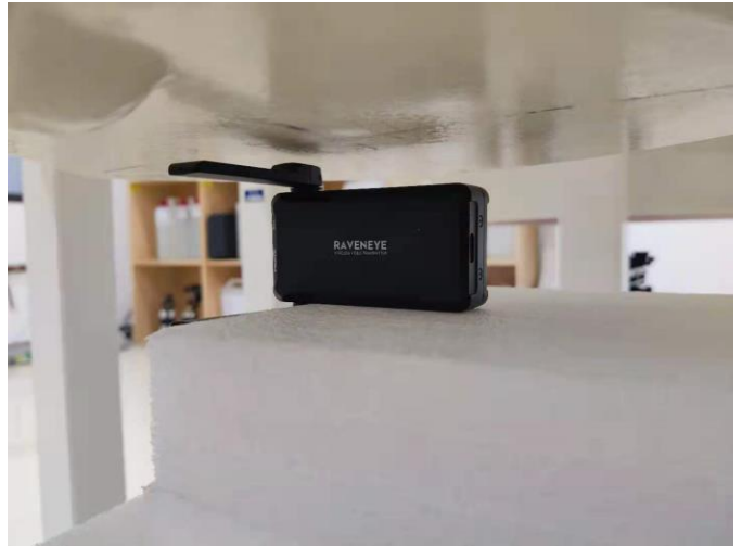
Right Side (5mm)