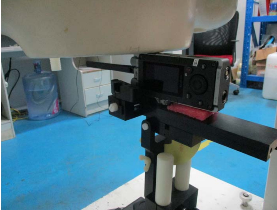
Test Position_Right Antenna Fold (0mm)