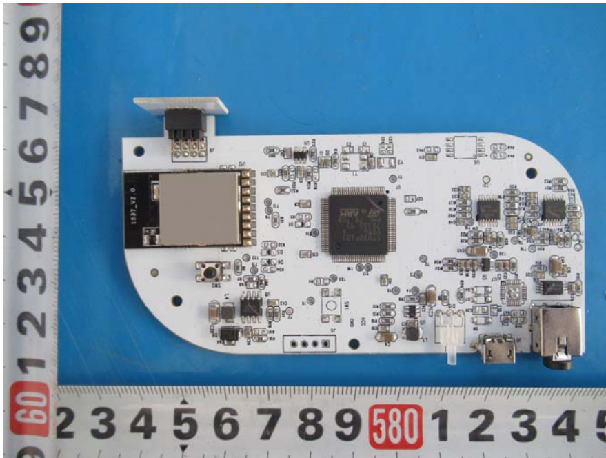
EUT – PCB-1 Top Shielding off View-1