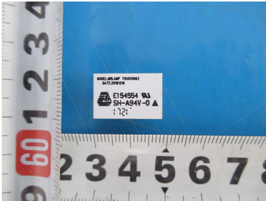
EUT – PCB-2 Bottom View