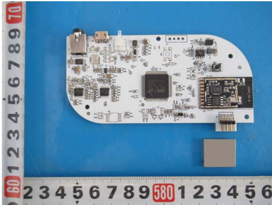
EUT – PCB-1 Bottom View