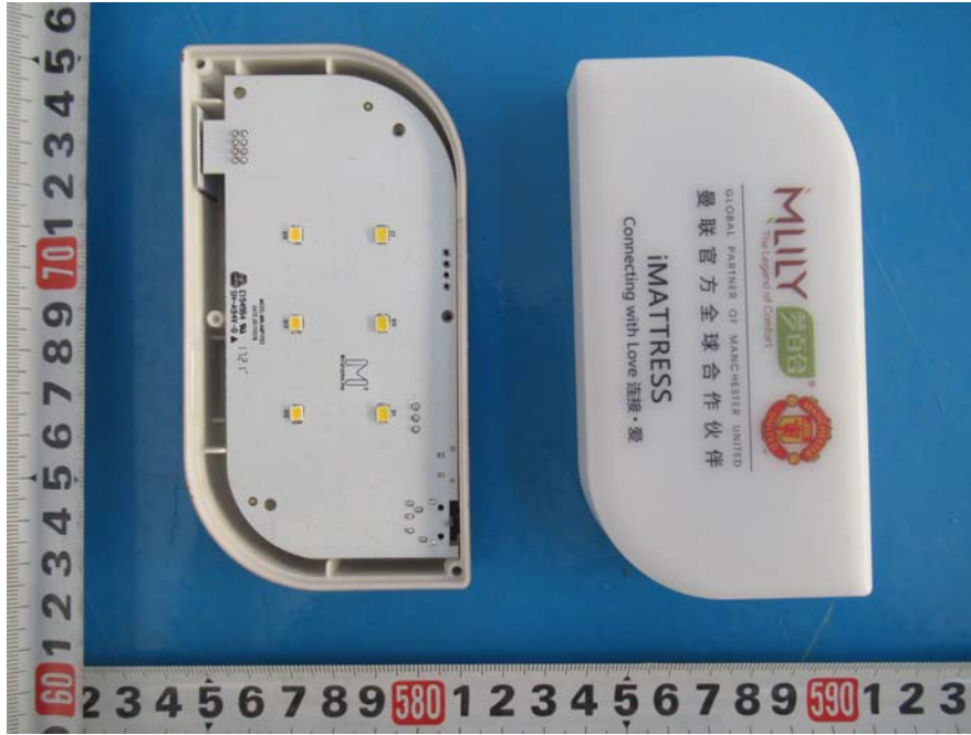
EUT – Cover off View-2