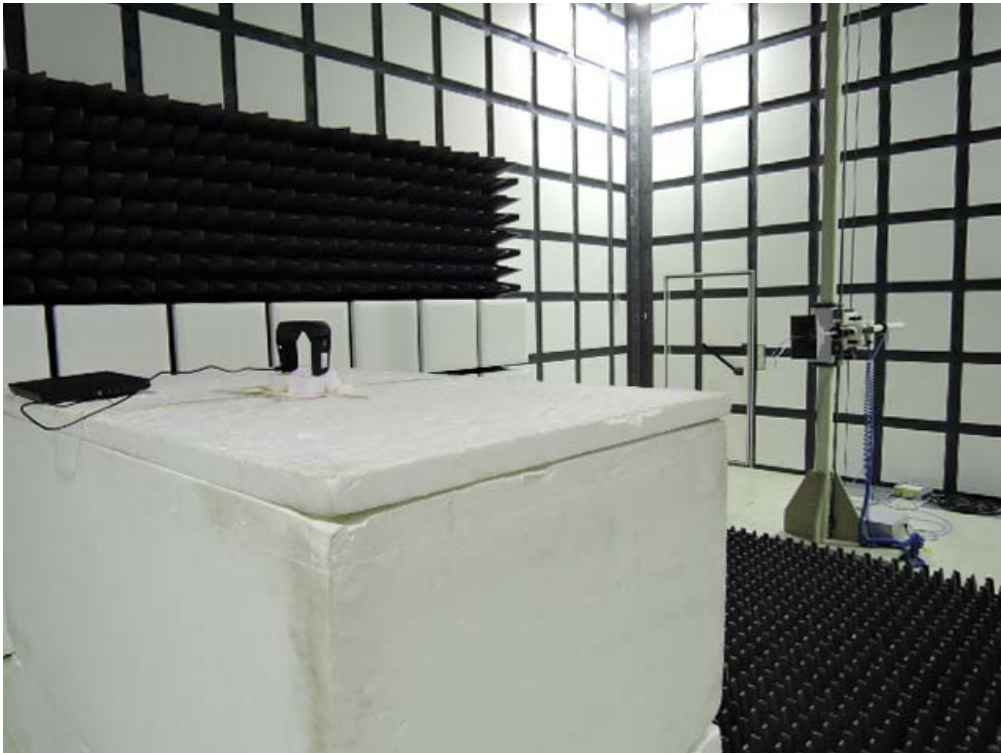
Radiated Emission Set up Photos (Front View)