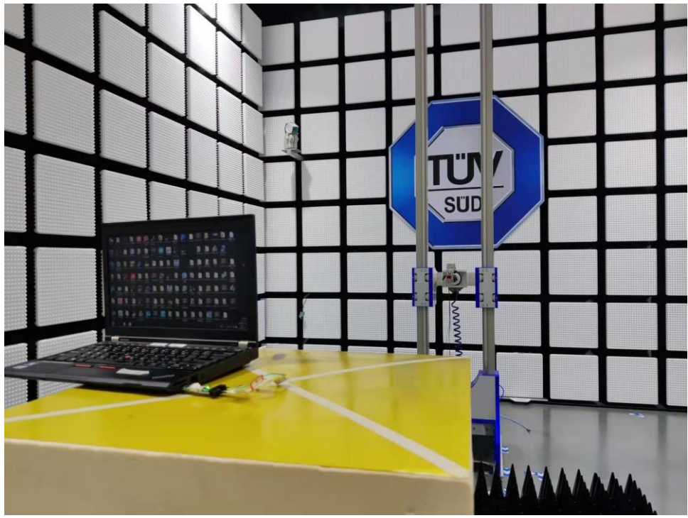
18GHz ~ 25GHz