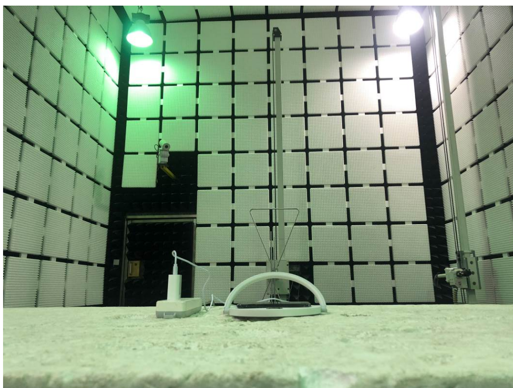
Radiated Emission below 1GHz-AC adapter charge mode