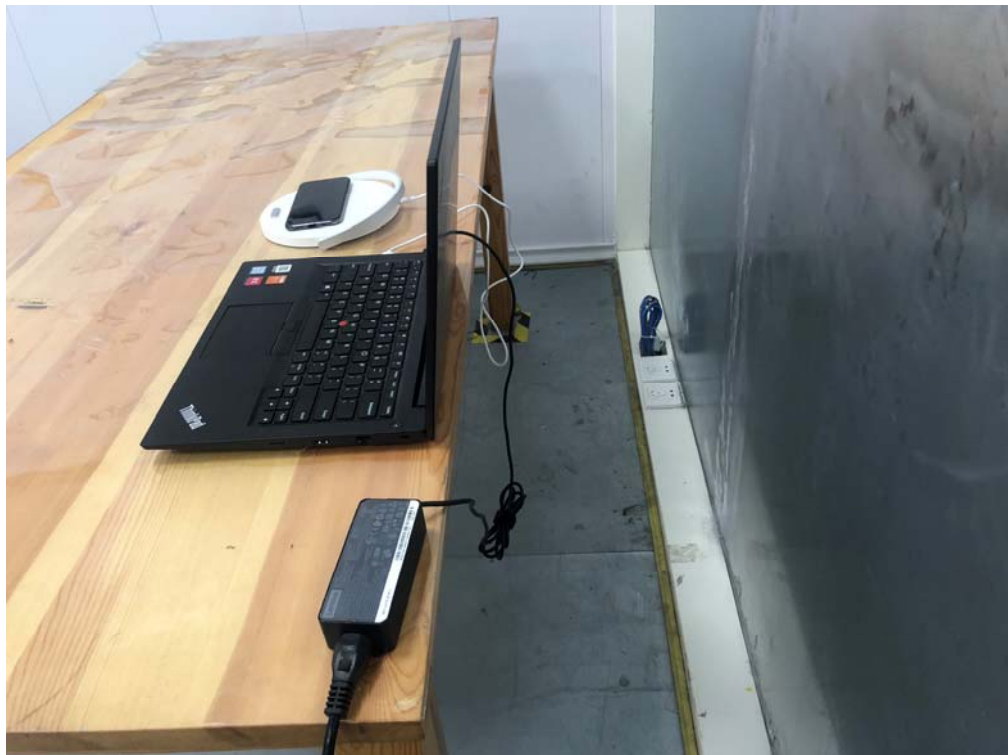
Conducted Emission-PC charge mode