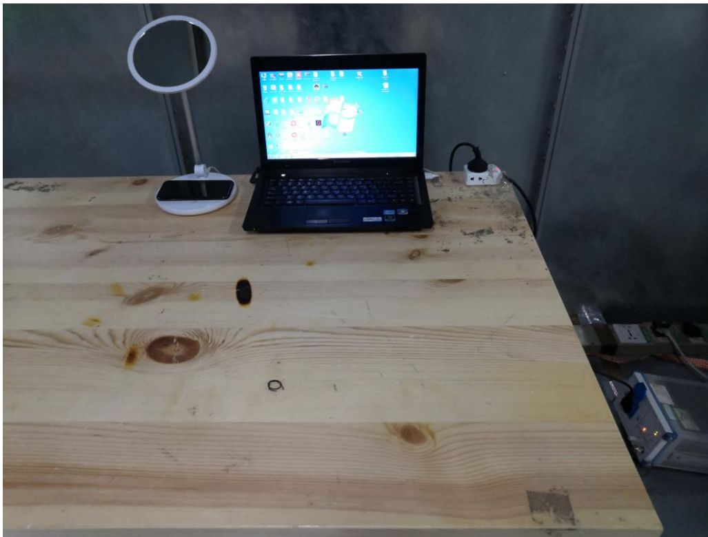
Conducted Emission-PC charge mode