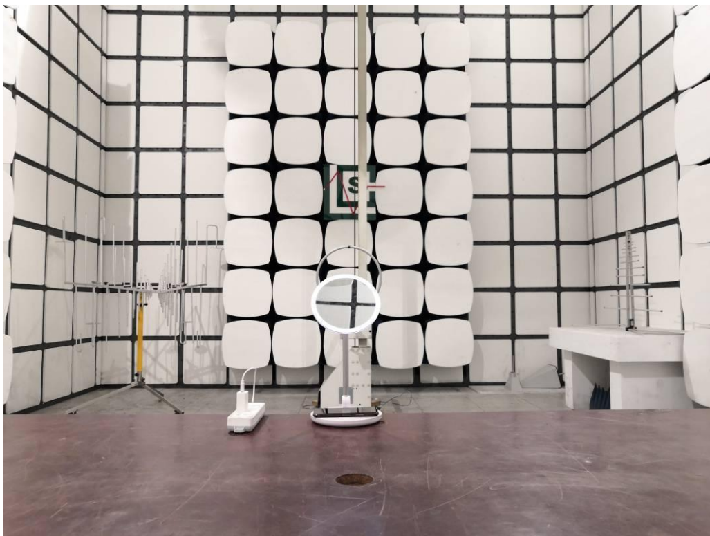
Radiated Emission below 30MHz-AC adapter charge mode