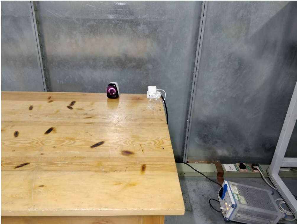
AC Conducted Emission of charge from power adapter mode