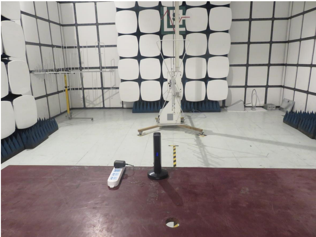
Radiated emission below 1GHz