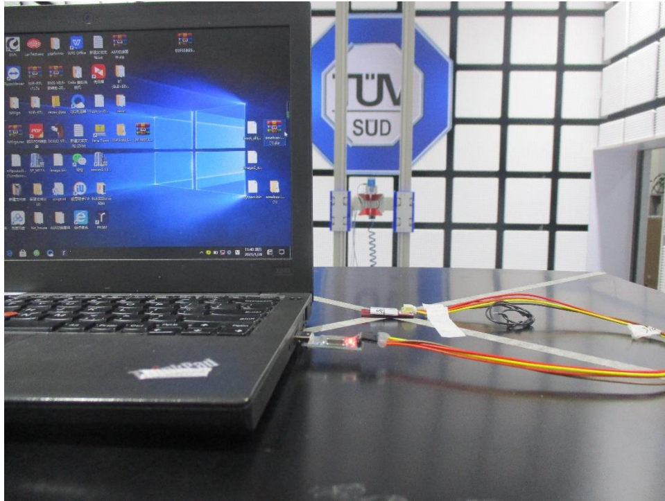
Radiated emissions 1GHz to 18GHz