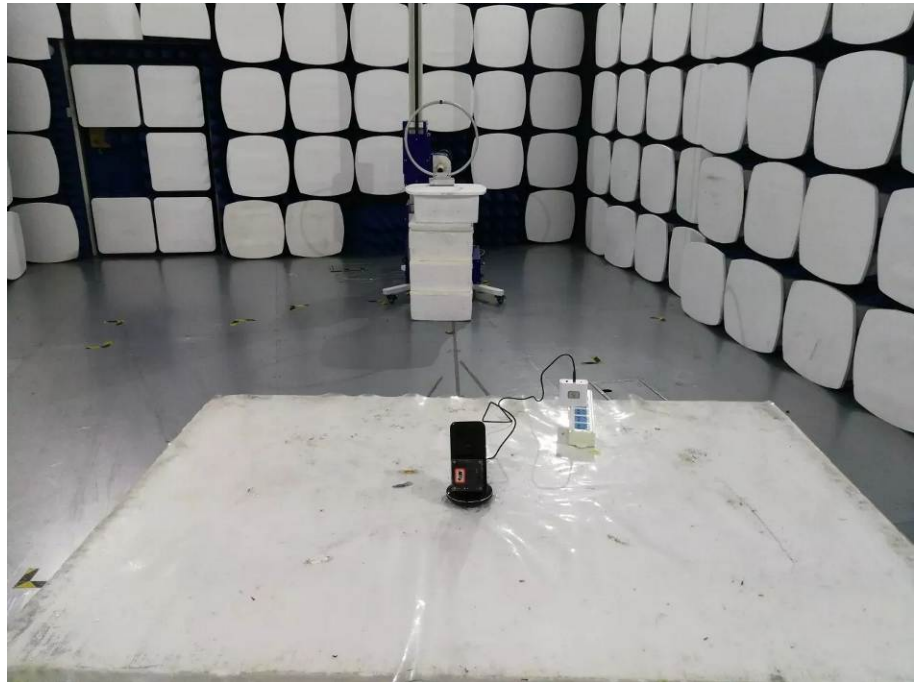
Radiated emission – above 30MHz