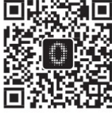
getwell Public Account

You can follow the getwell public account or add customer service WeChat for consultation.