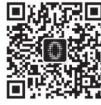
Customer Service WeChat