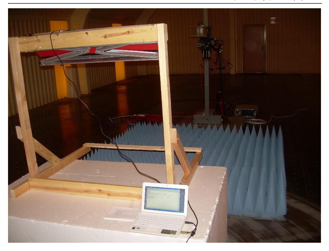
Photograph 4. Back View Radiated Emissions Above 1000 – 12400 MHz Range – Awning Extended