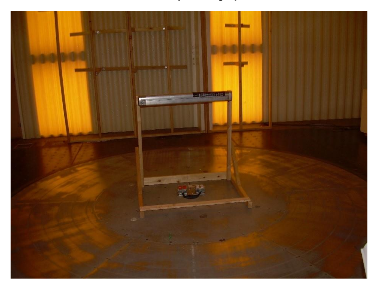
Photograph 1. Front View Radiated Emissions 30 to 1000 MHz Range – Awning Retracted