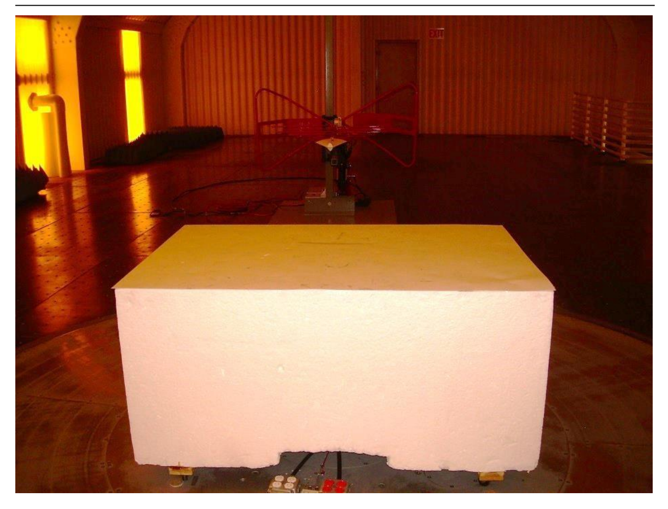
Photograph 6. Test Setup for Emissions From 30 MHz to 1000 MHz