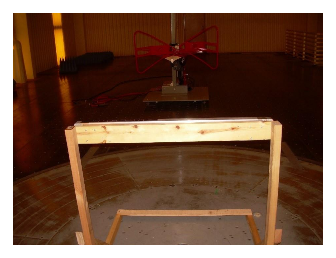
Photograph 2. Back View Radiated Emissions 30 to 1000 MHz Range – Awning Retracted