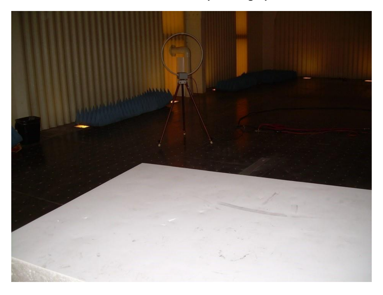
Photograph 5. Test Setup for Emissions Below 30 MHz