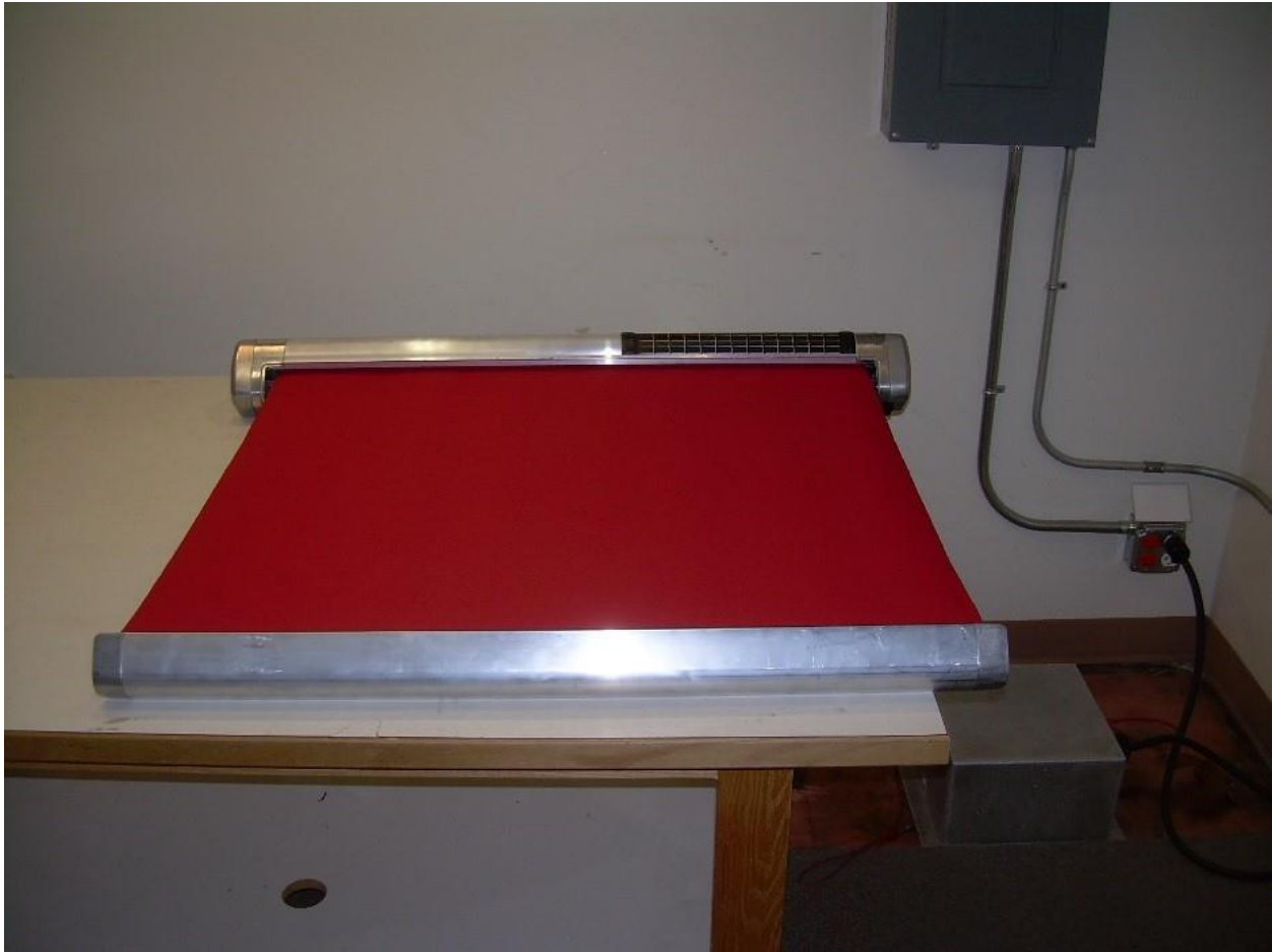
Photograph 4. Top View of the EUT with Awning Extended