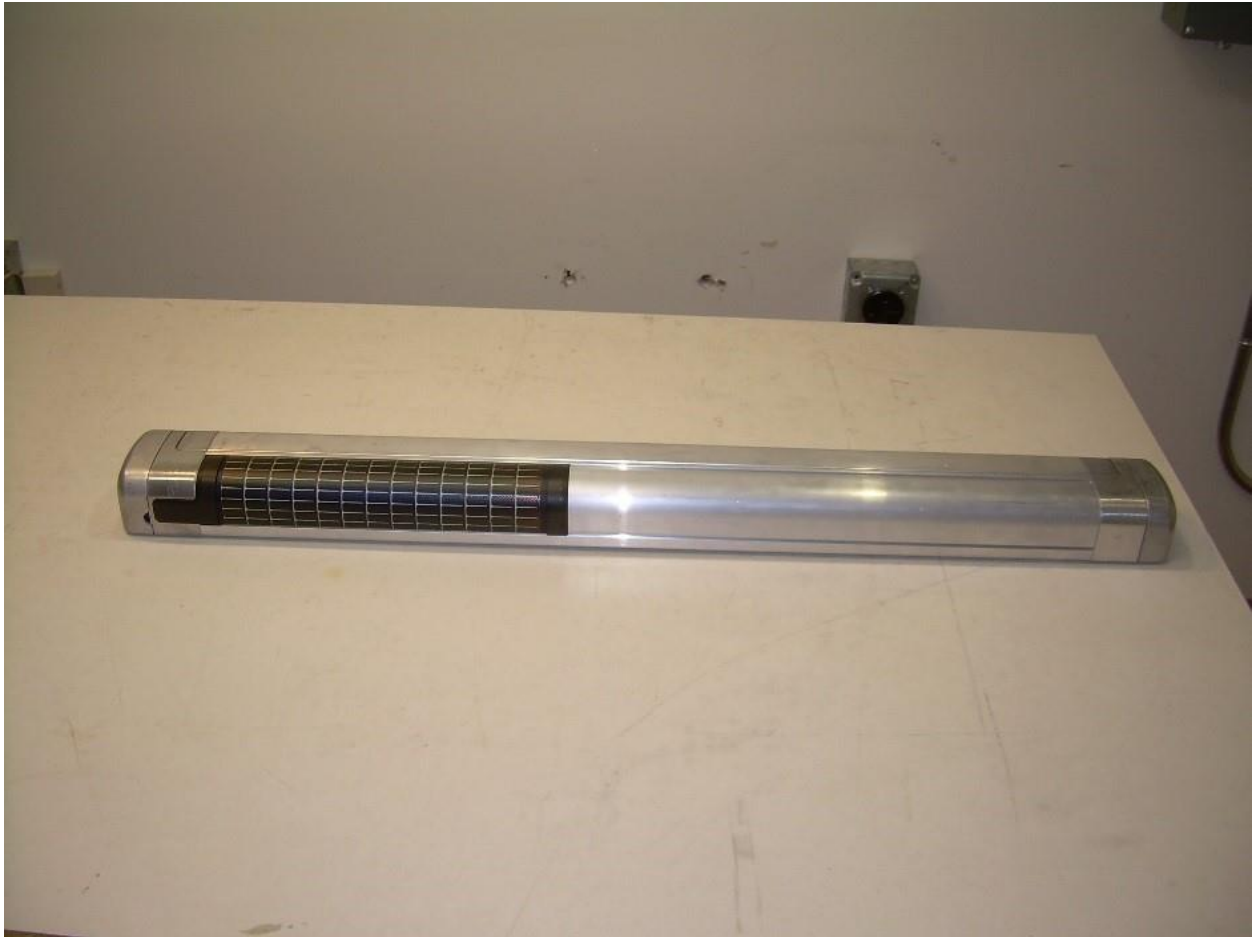
Photograph 1. Top/Front View of the EUT