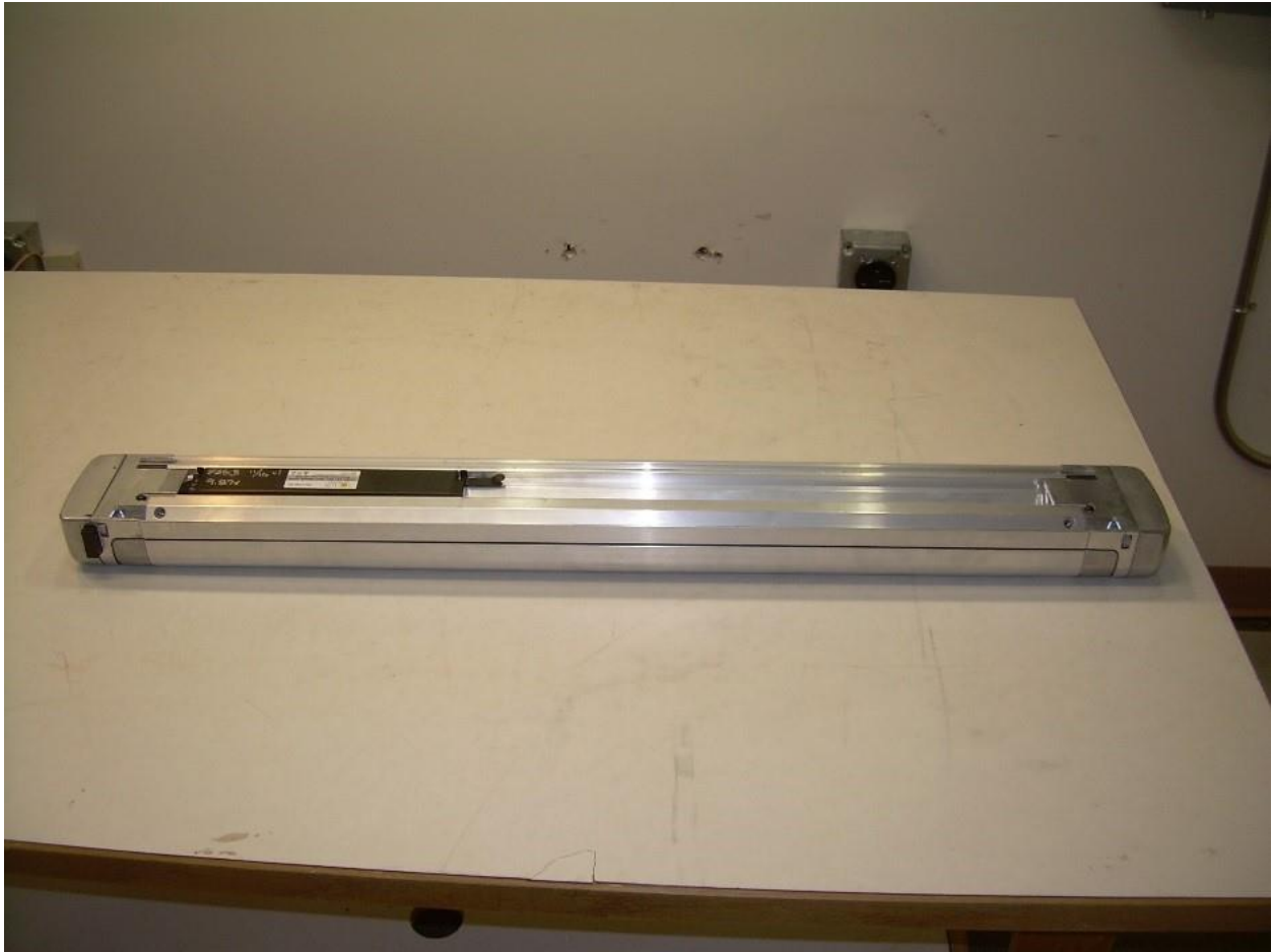
Photograph 2. Back/Bottom View of the EUT