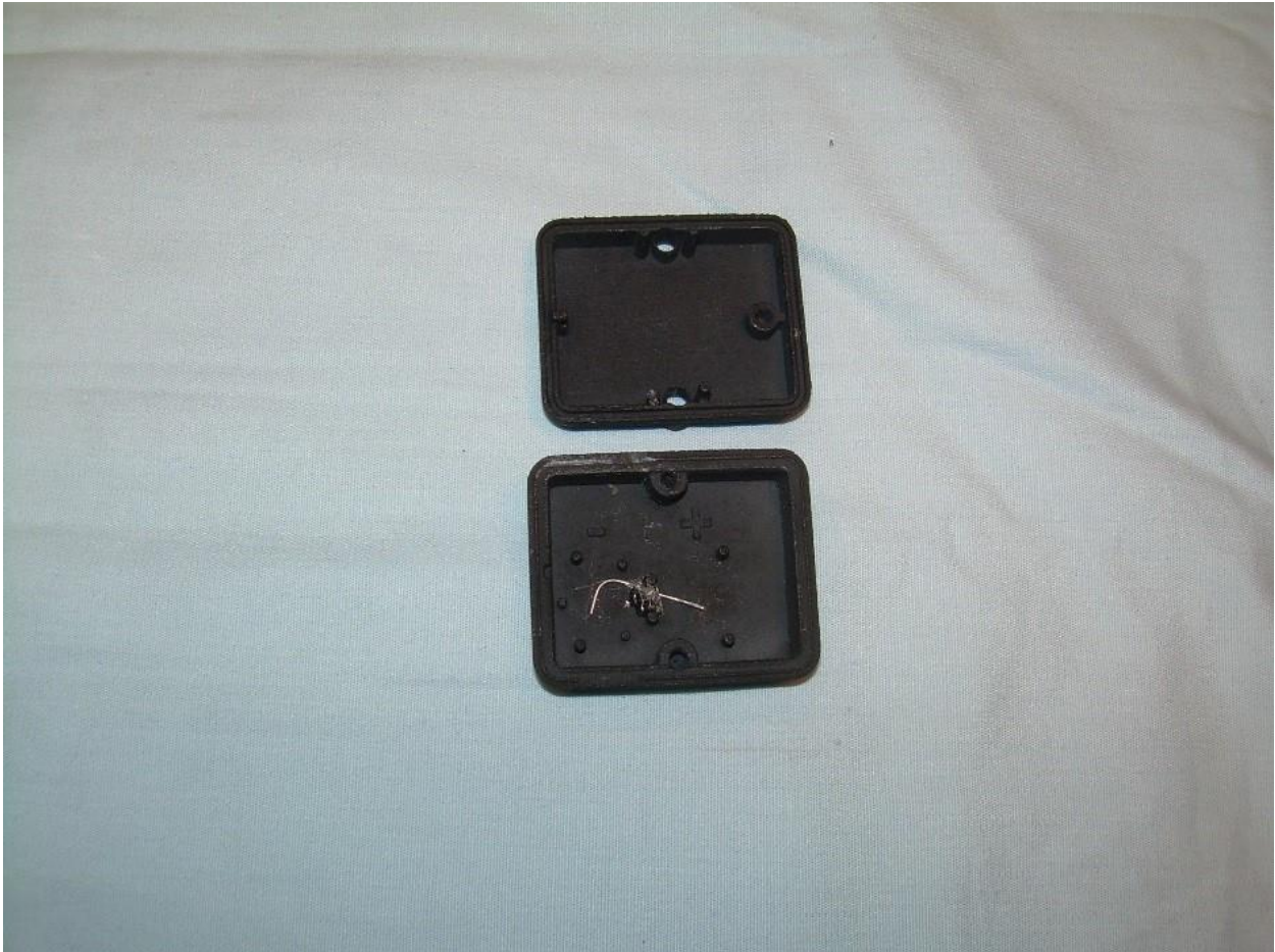
Photograph 2 – View of the EUT Housing Components