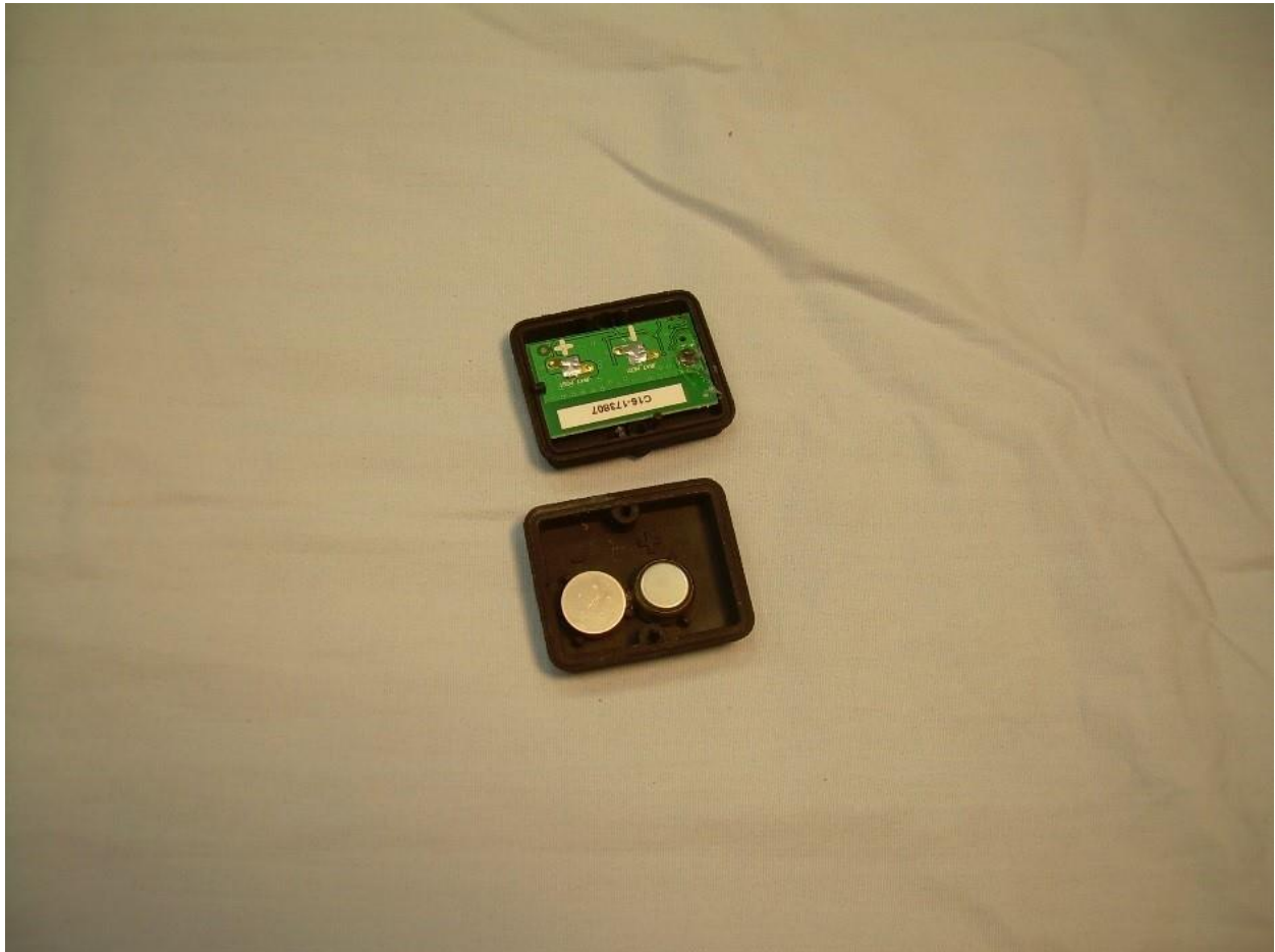
Photograph 1 – View of the Housing Open Showing PCB and Battery Placement