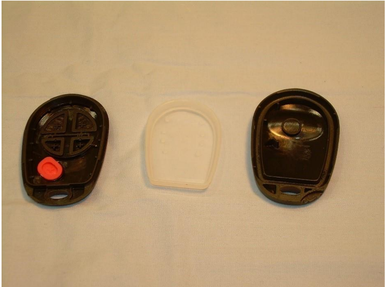
Photograph 2 – View of the Housing Components