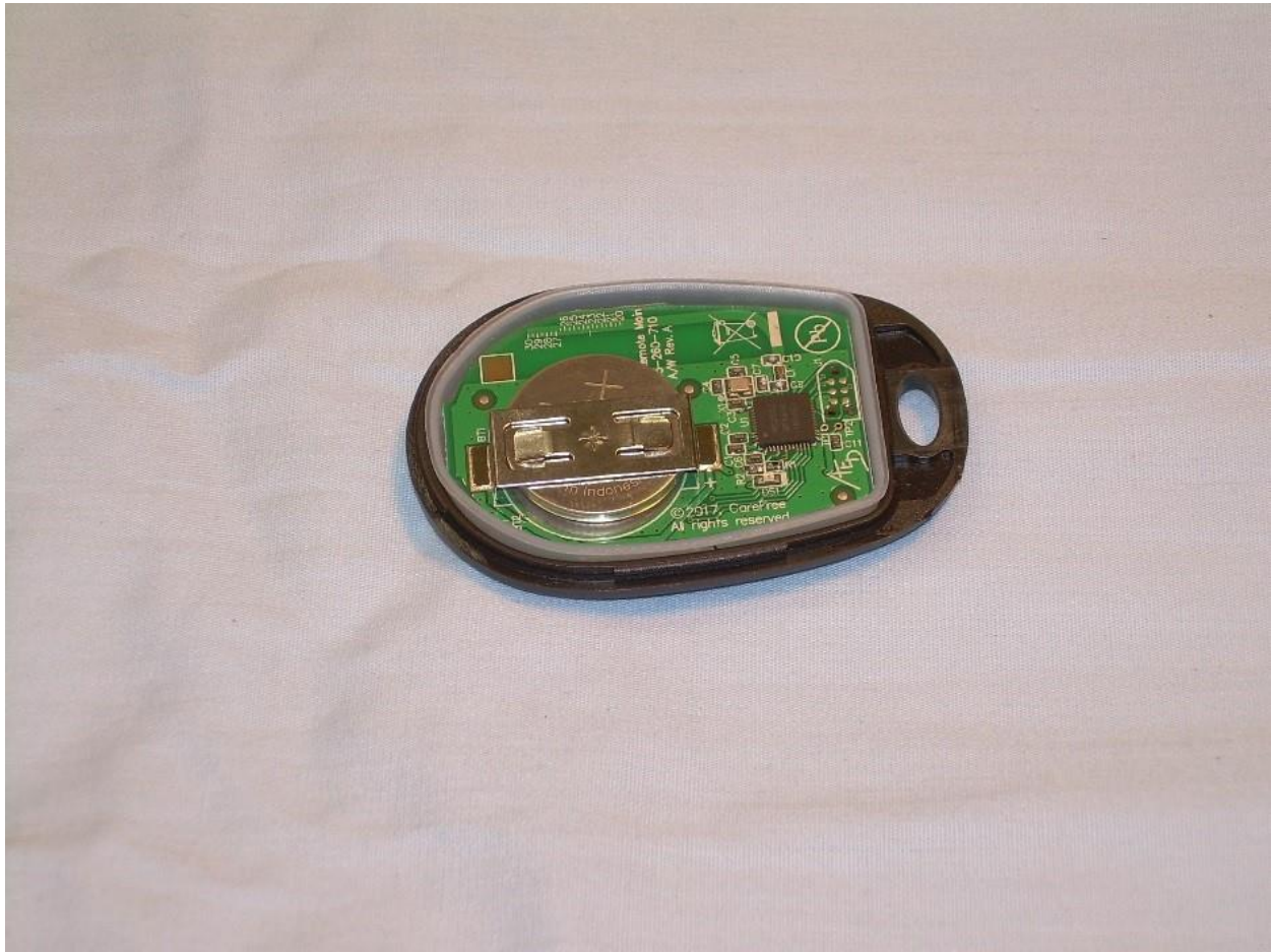
Photograph 1 – View of the PCB in the Housing