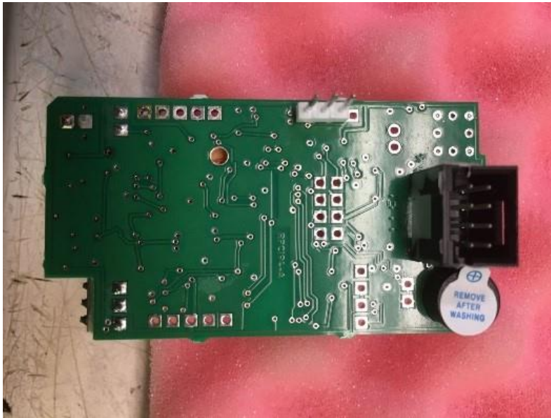
Photograph 2 – View of the Back Side of the EUT PCB