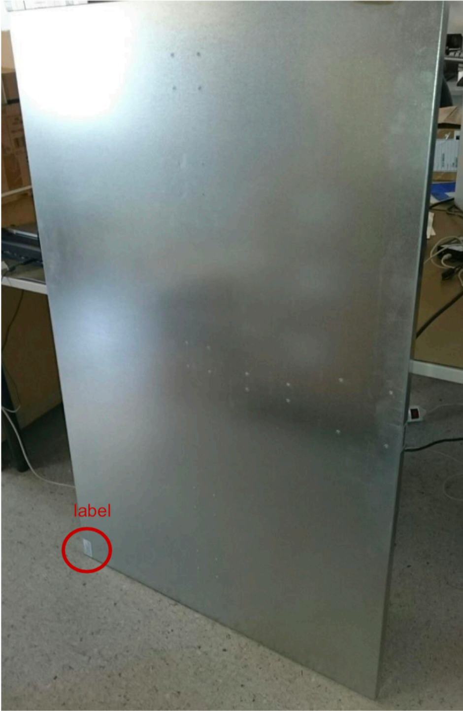
Figure 3 Position of the Label with FCC and IC ID for the LeanOrder detectionShelf

The Label with FCC and IC ID, as it is shown in Figure 1 and Figure 2, is placed on the corner of the back side of the LeanOrder detectionShelf, as shown in Figure 3.