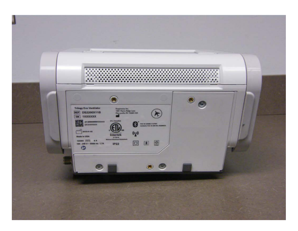
Figure 5: Label Location