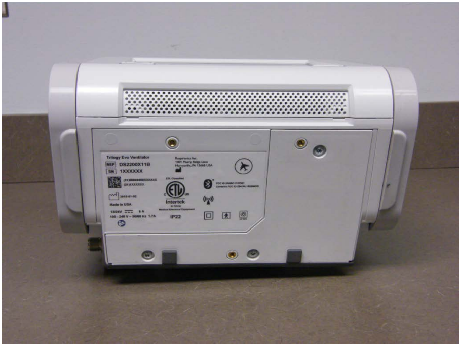
Figure 4: Bottom View of Trilogy EVO Device