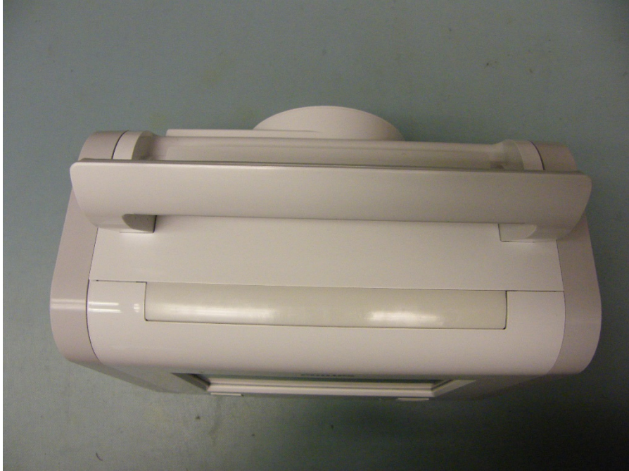
Figure 5: Top View of Trilogy EVO Device