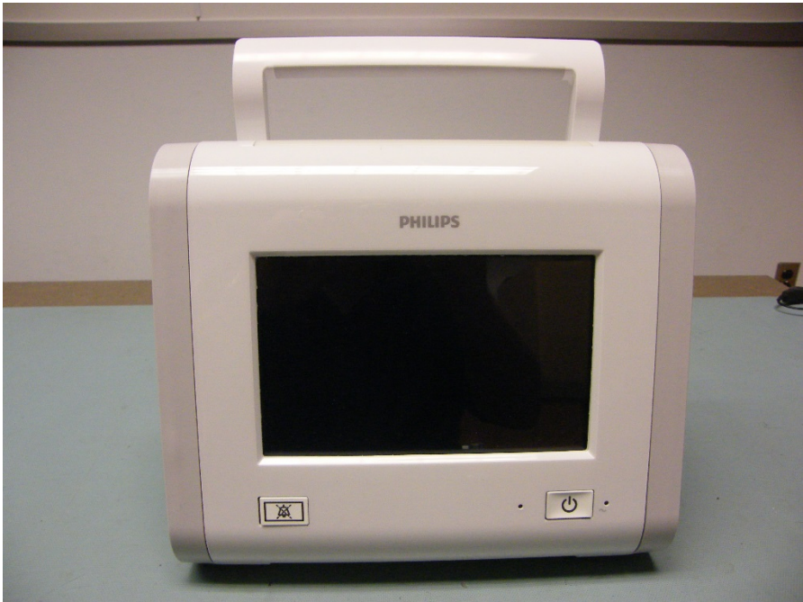
Figure 1: Front View of Trilogy EVO Device

FCC-ID: 2AN9Z-1127941 / IC ID: 3234B-1127941