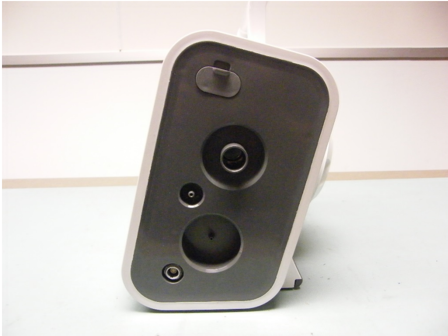
Figure 4: Right Side View of Trilogy EVO Device