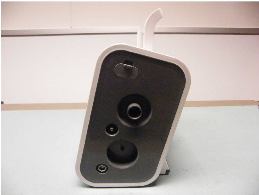
Figure 4: Right Side View of Trilogy EVO Device