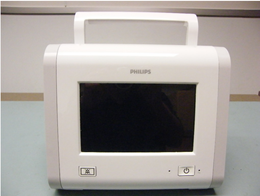
Figure 1: Front View of Trilogy EVO Device

FCC-ID: 2AN9Z-1127941 / IC ID: 3234B-1127941