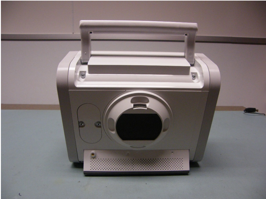
Figure 2: Rear View of Trilogy EVO Device