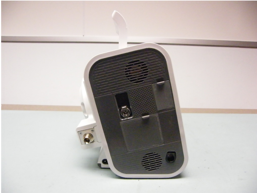
Figure 3: Left Side View of Trilogy EVO Device