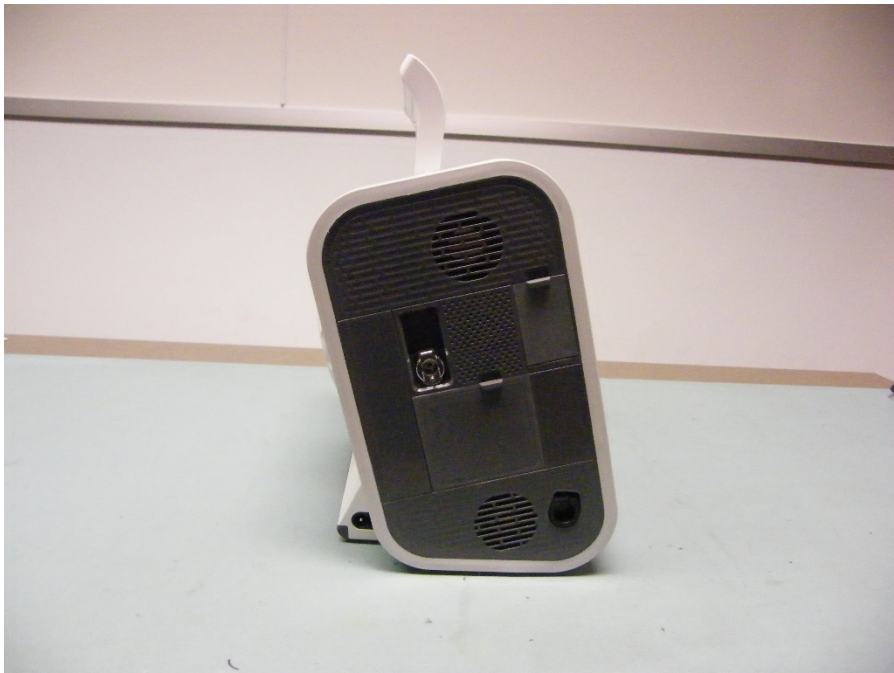
Figure 3: Left Side View of Trilogy EVO Device