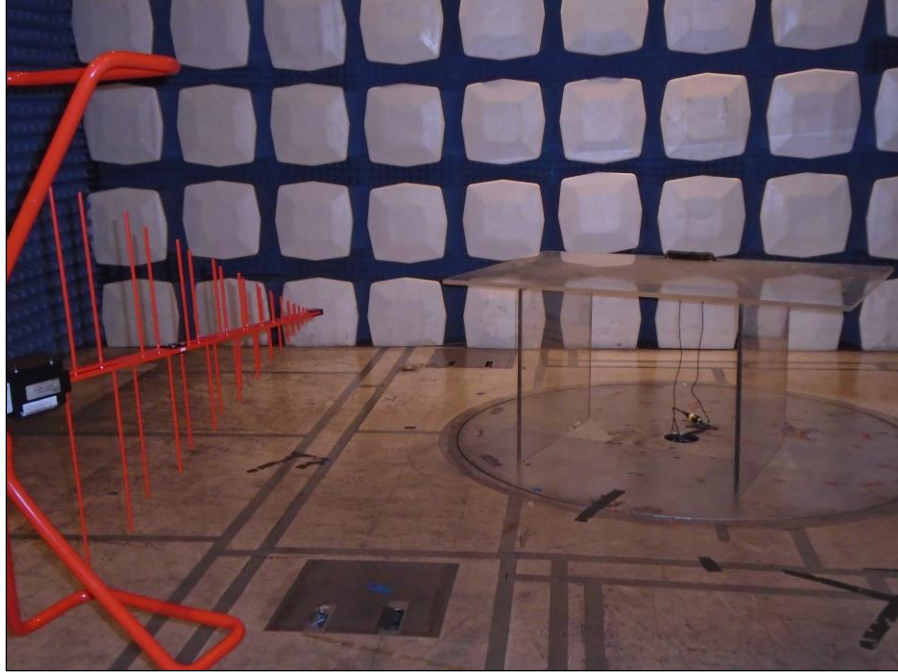
Photograph 1. Radiated Emissions, setup below 1 GHz