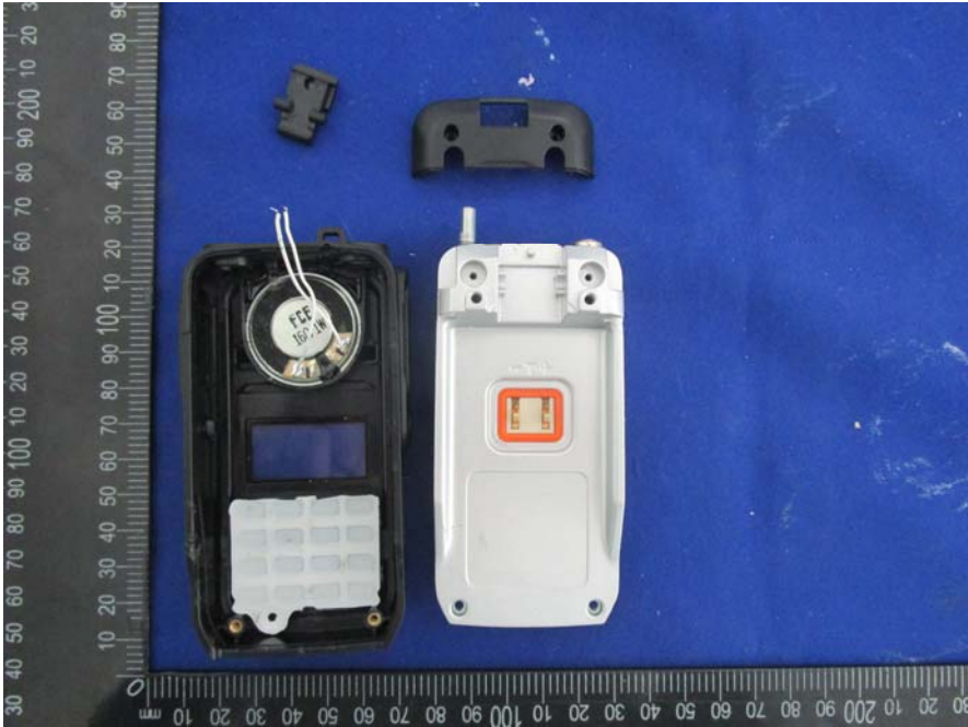
EUT –Uncover View