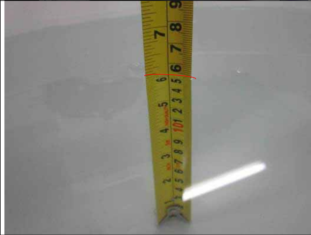
Liquid depth \geq 15cm