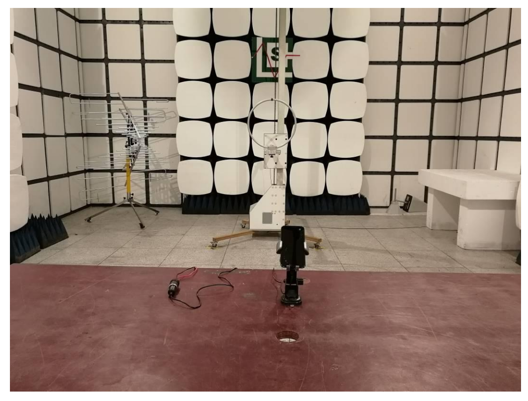
Radiated Emission below 30MHz- Car Charger charge mode