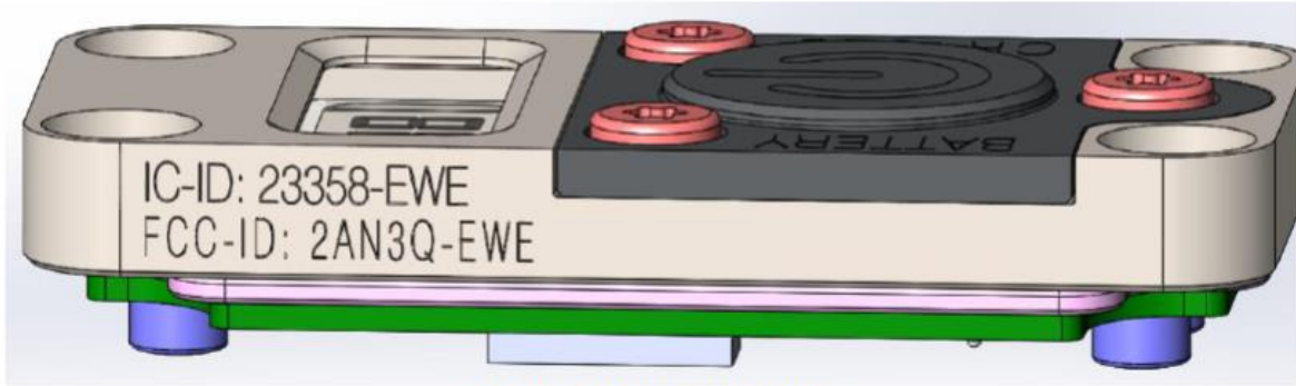
Label on Module (side view)