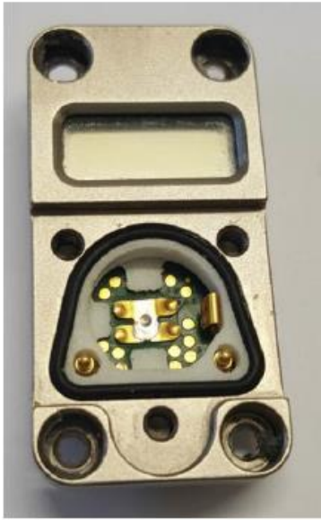
Module Top View