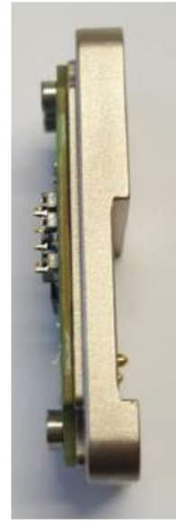
Module Side View