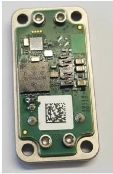
Module Bottom View