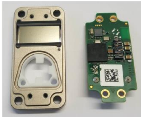
Mechanical Lid and PCB Bottom