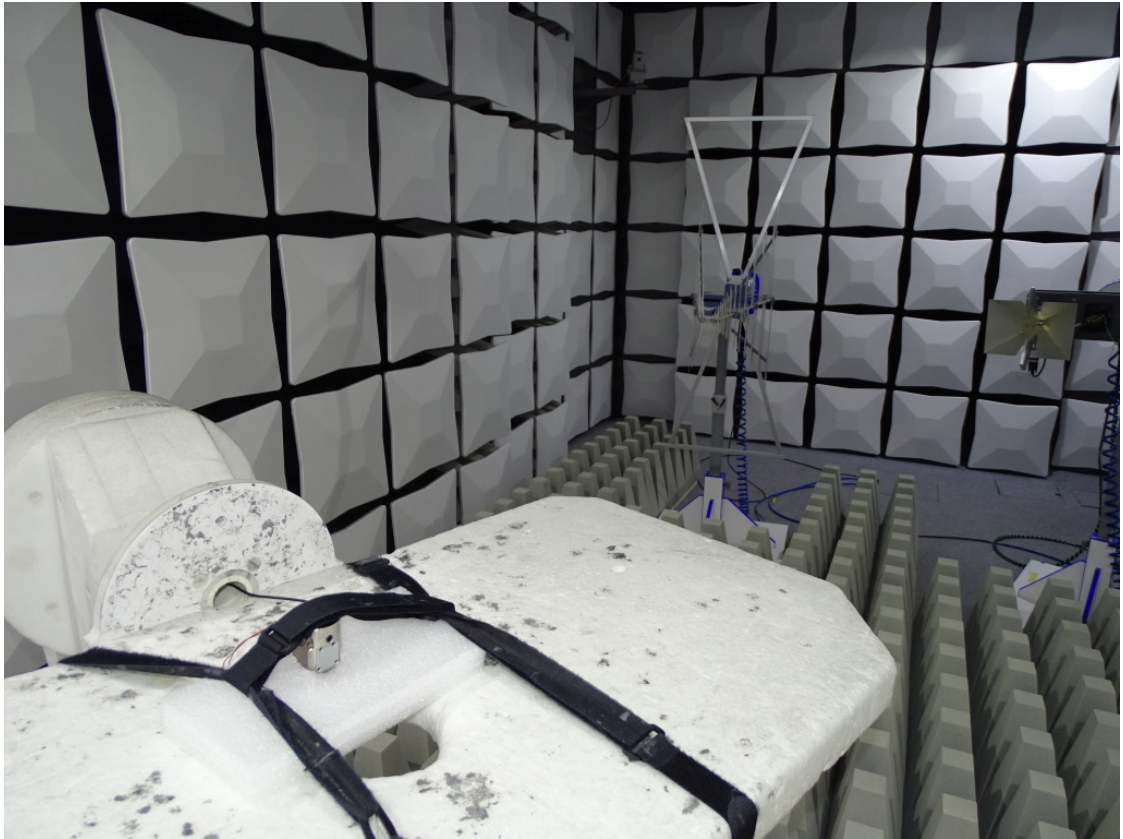
Photo 1: Test setup for radiated measurements (Enclosure, fully-anechoic chamber, 1-18 GHz intentional radiator §15 / 30 MHz – 10/20 GHz §22/24/27)