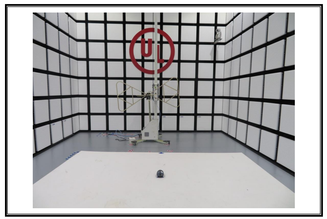
RADIATED RF MEASUREMENT SETUP (ABOVE 1 GHz- X axis)