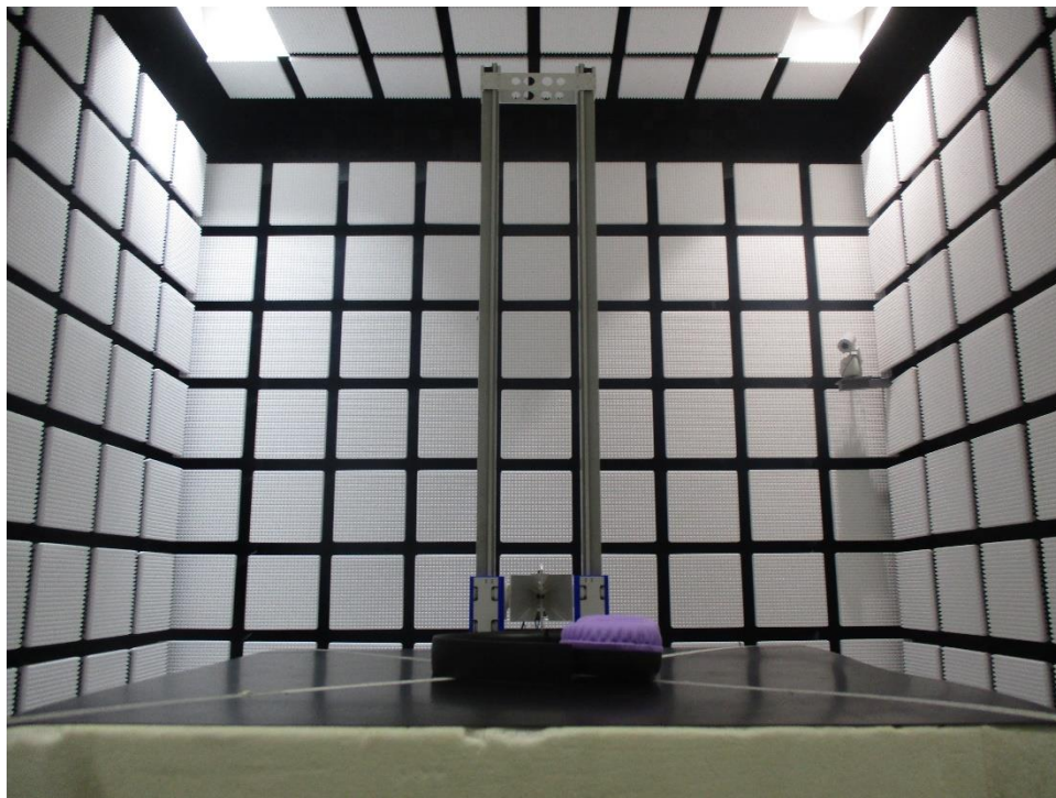
Spurious radiated above 1GHz