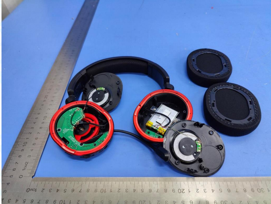
Photo 7 Appearance of PCB