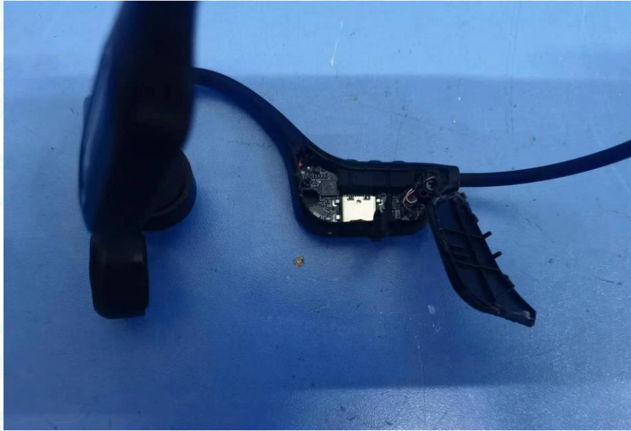
Photo 9 Internal of EUT