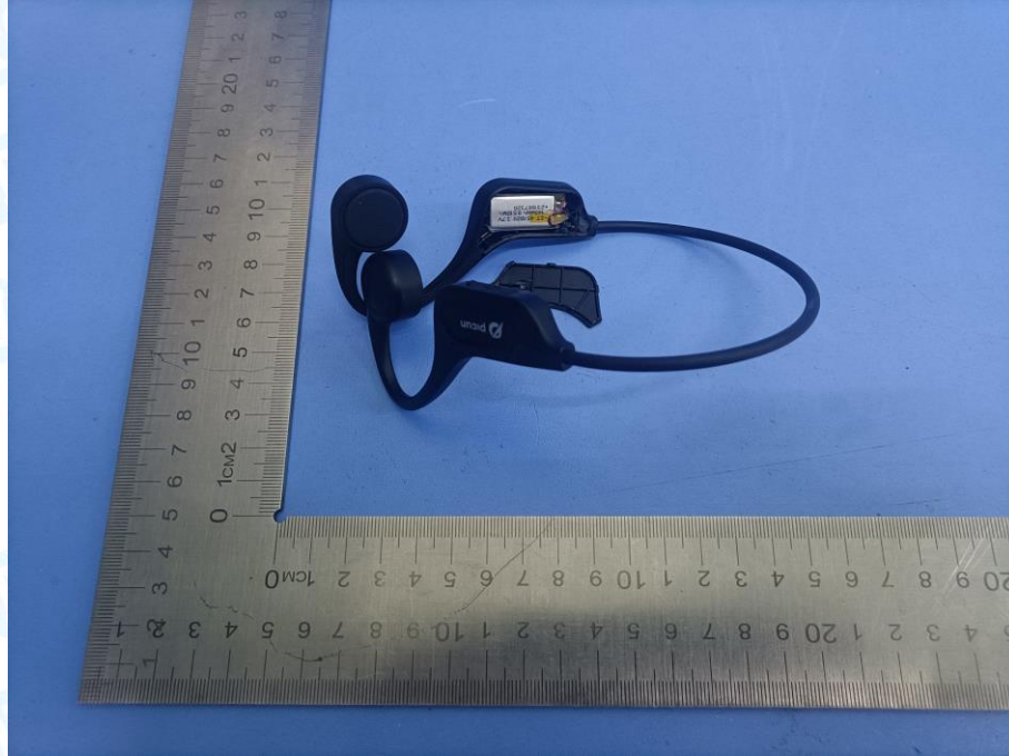
Photo 11 Appearance of PCB