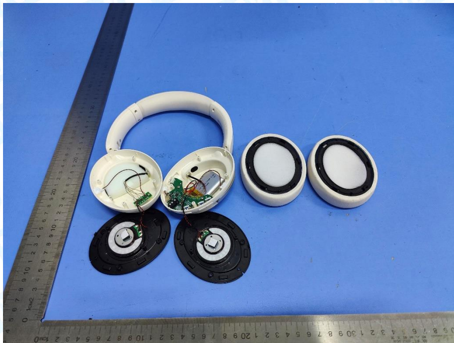
Photo 8 Internal of EUT