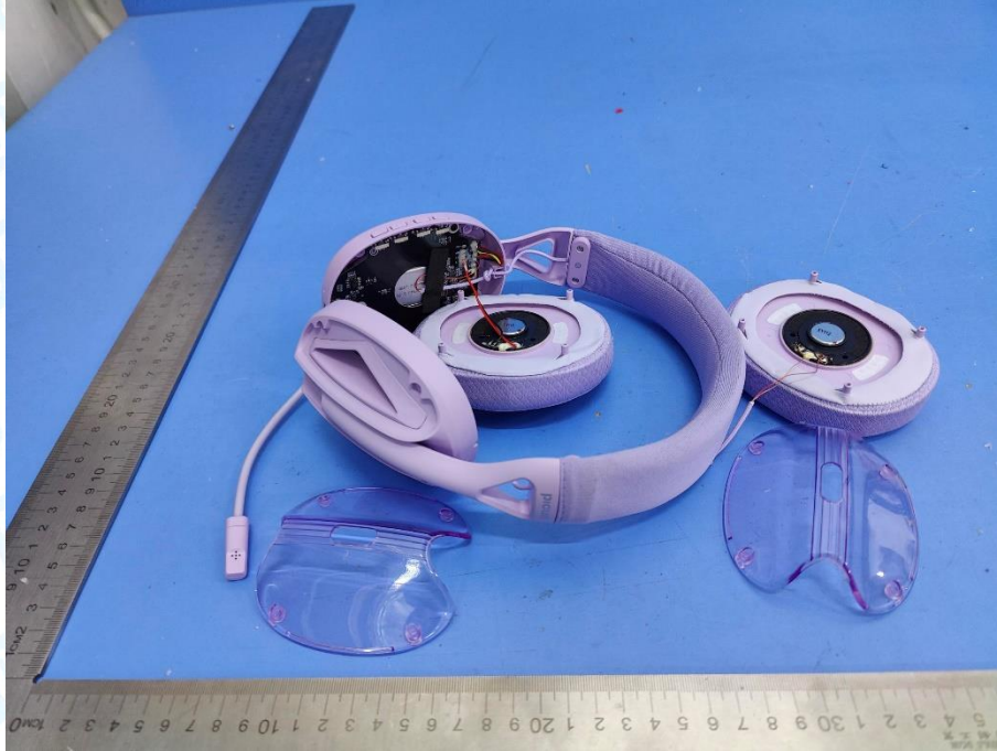
Photo 7 Appearance of PCB