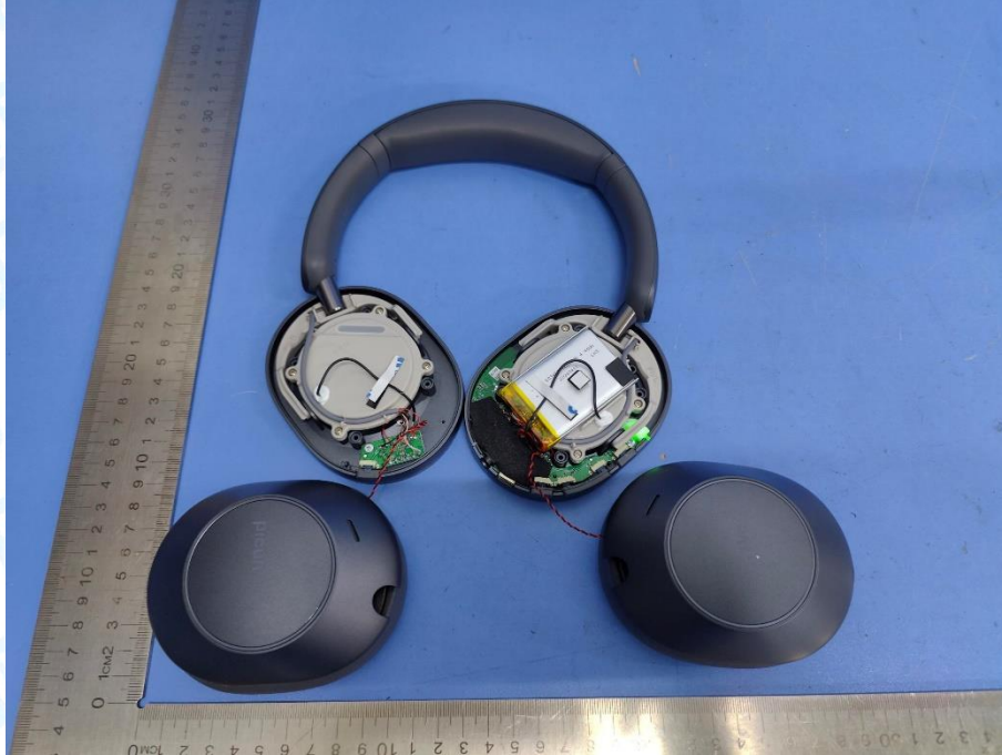
Photo 8 Internal of EUT