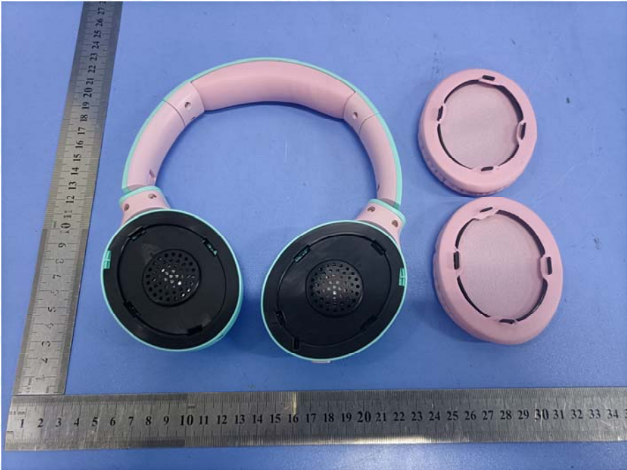
Photo 7 Internal of EUT