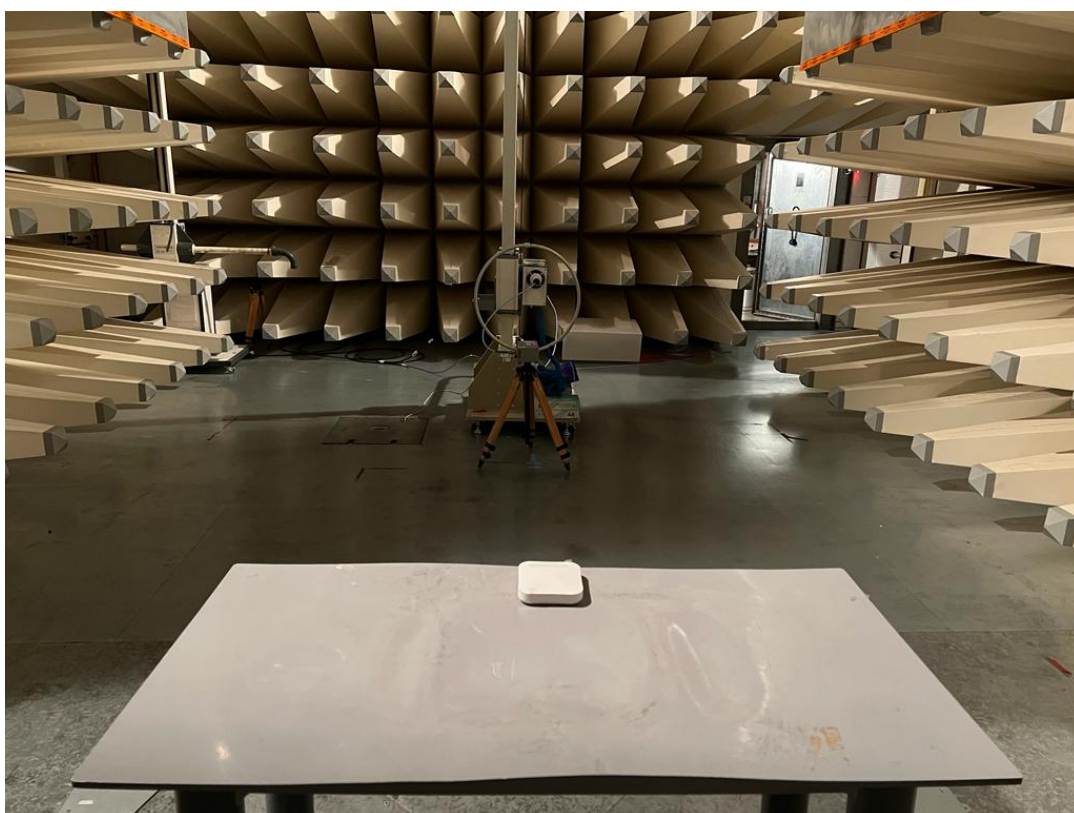
Set up for Radiated Emission Below 30MHz