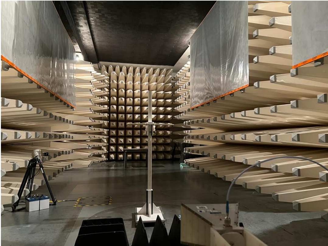
Set up for Radiated Emission Above 1G