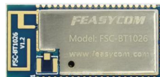
Figure 1: FSC-BT1026 picture