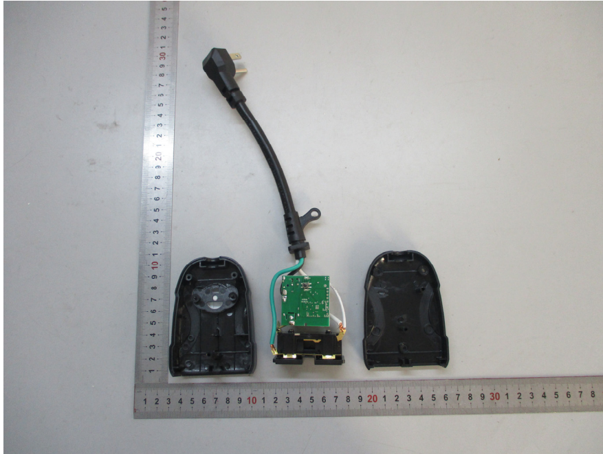
EUT – PCB Top View