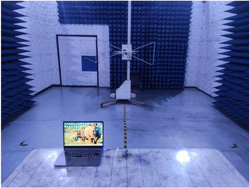
RADIATED EMISSION TEST SETUP ABOVE 1GHz