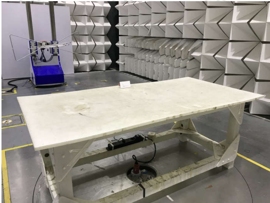
Radiated spurious emission Test Setup-2(Below 1GHz)