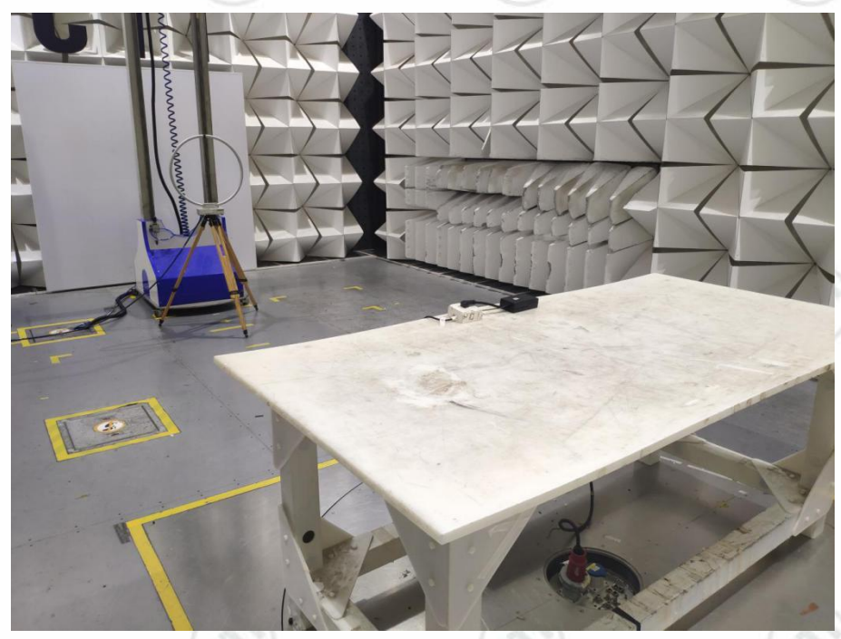
Radiated spurious emission Test Setup-1(Below 30MHz)