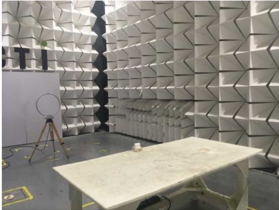
Radiated spurious emission Test Setup-1(Below 30MHz)