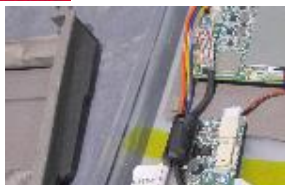
One Ferrite on the LVSD Cable under the Plastic Cover PN 0461178181