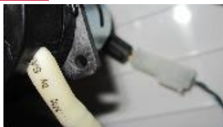
Pump 4 Cable at Pump Ferrite PN 046178181