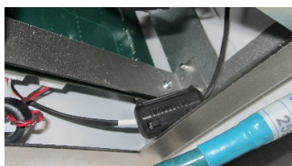
One Ferrite on LED Cable PN: 0431164281