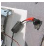
USB Cable near 90 degree Connector Ferrite PN 0444164281