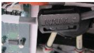
One Ferrite on Motor Cable bundle near Control Board PN: 0461167281