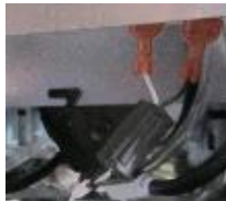
Valve 2 Cable at Valve Ferrite PN 046178181