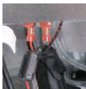
Valve 1 Cable at Valve Ferrite PN 046178181