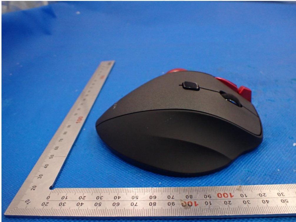
PORT VIEW OF EUT