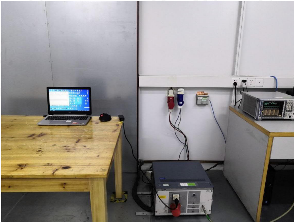
CONDUCTED TEST SETUP