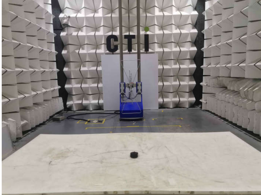
Radiated spurious emission Test Setup-1 (30MHz~1GHz)