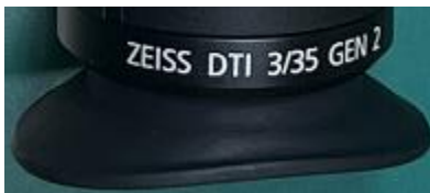
Model: DTI 3/35 GEN 2