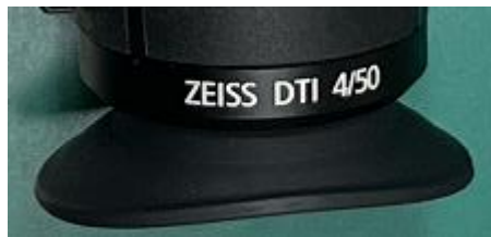
Model: DTI 4/50