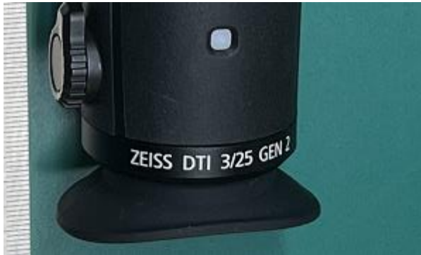
Model: DTI 3/25 GEN 2