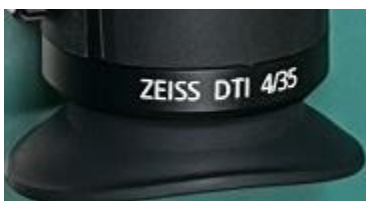
Model: DTI 4/35