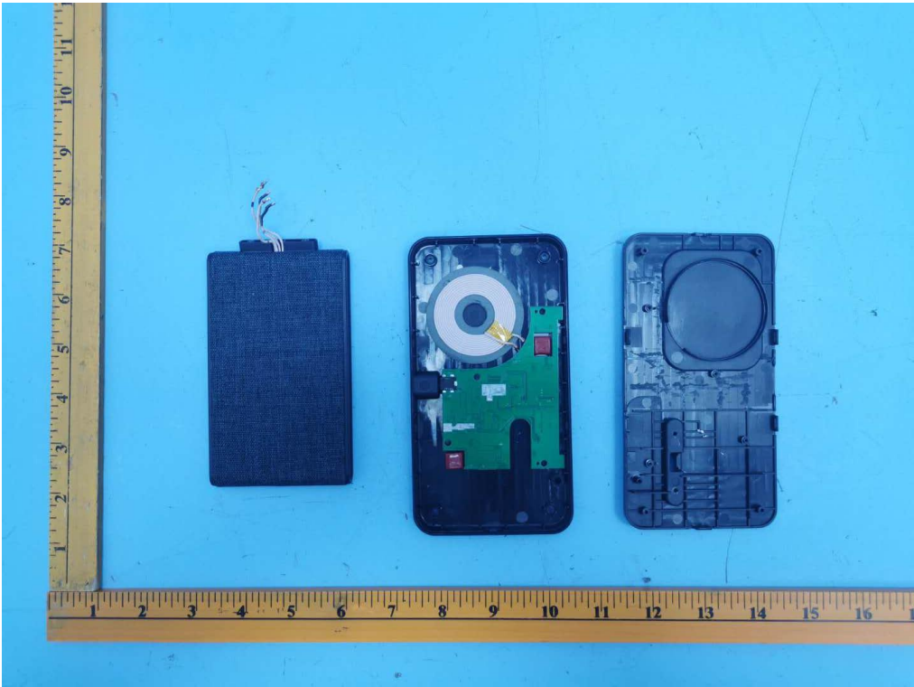
OPEN VIEW OF EUT-2