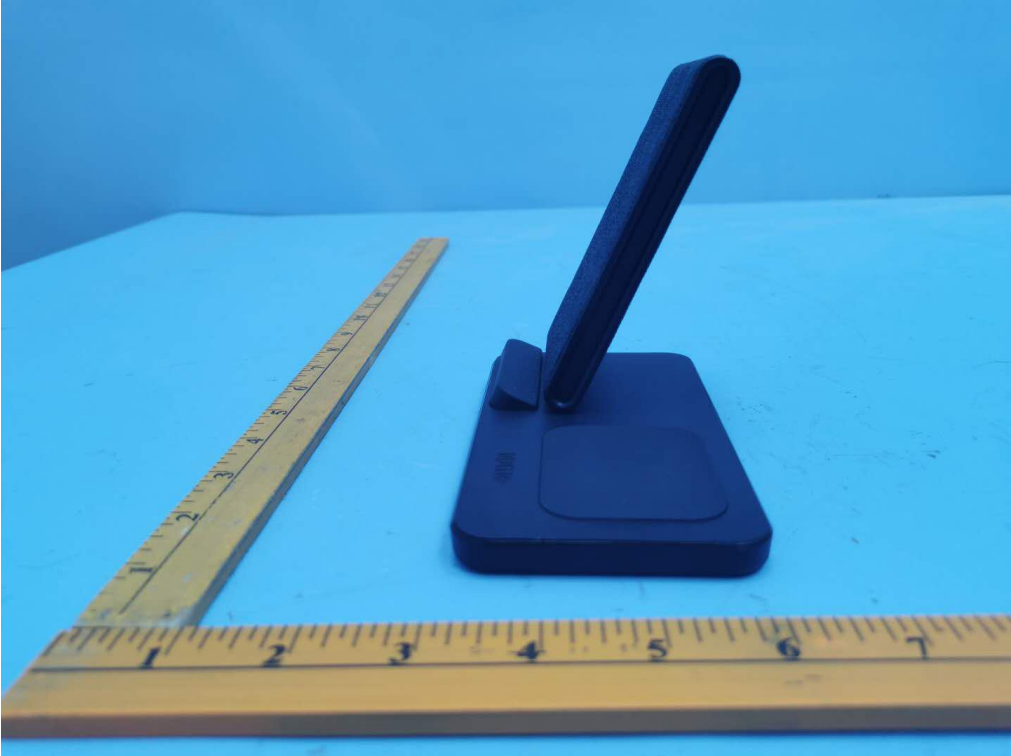
BACK VIEW OF EUT