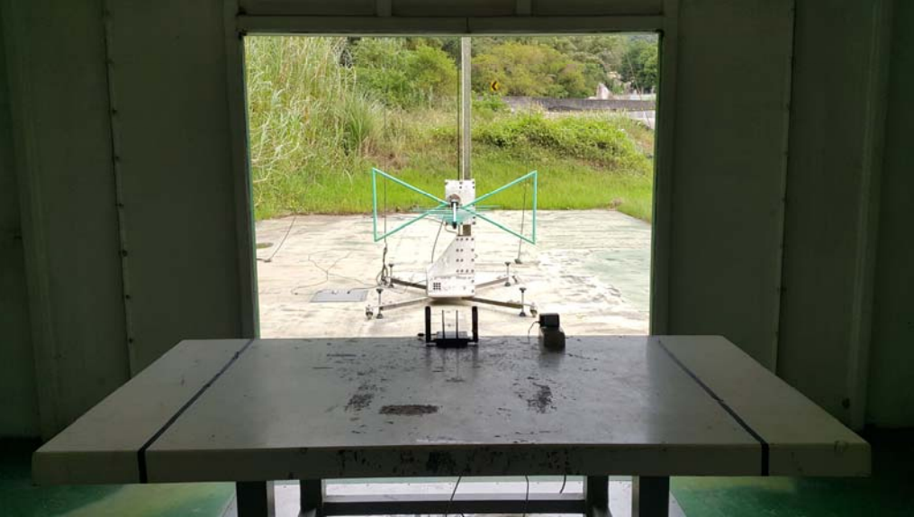
Back View of Radiated Test-Laird Core