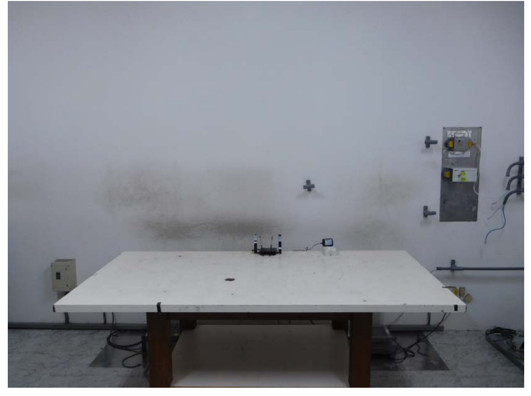
Back View of Conducted Test-Laird Core