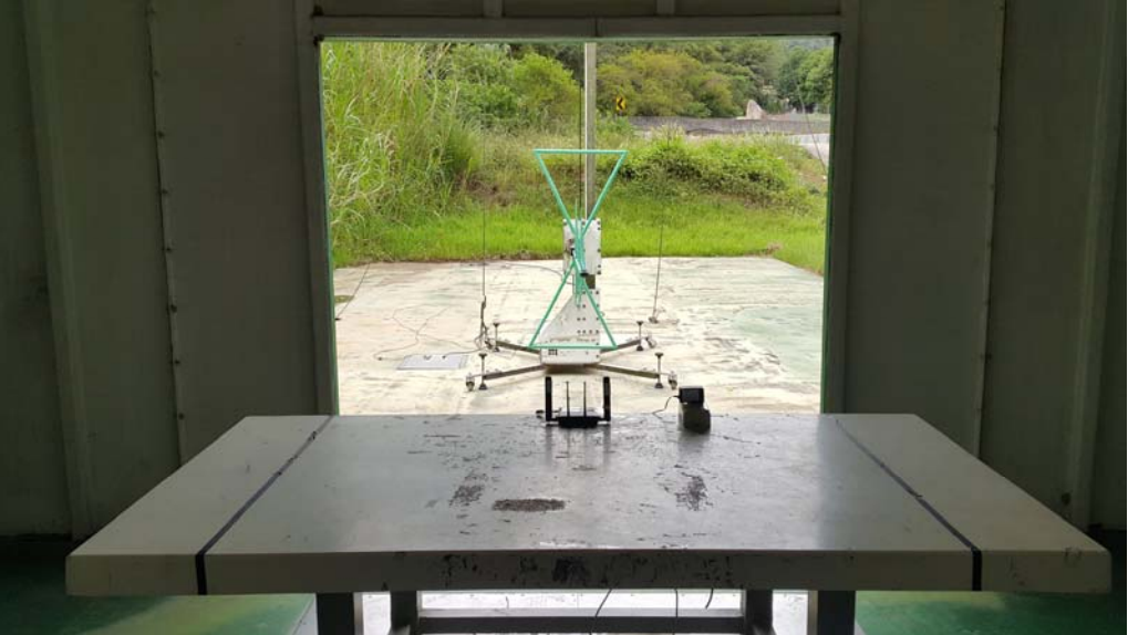
Back View of Radiated Test-WRC Core